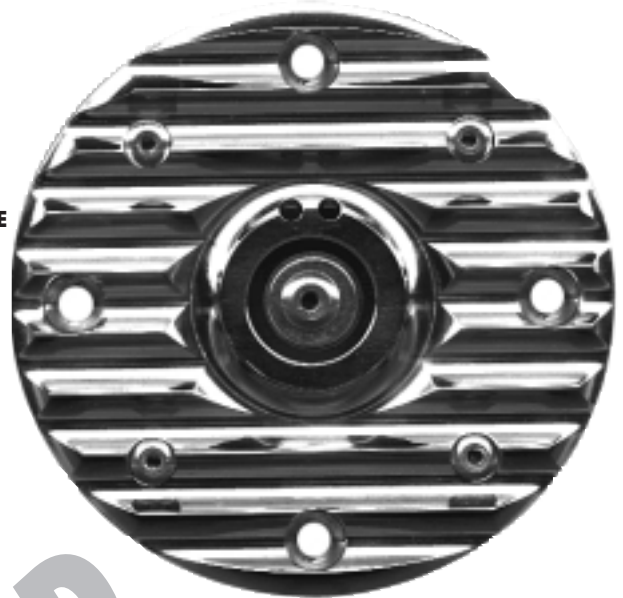
nose-cone outer-cover, actual size