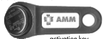
activation-key, actual size